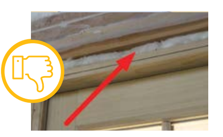
ONE INCENTIVE PER HOME, REGARDLESS OF THE NUMBER OF INDOOR HEADS