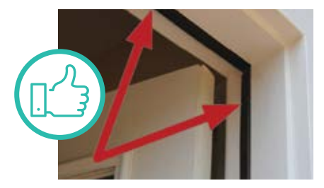
GOOD WEATHERSTRIPPING