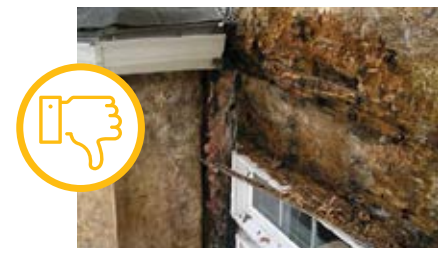
IMPROPERLY FLASHED DOOR HAS STRUCTURAL DAMAGE DUE TO WATER PENETRATION