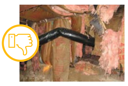
UNPREPPED CRAWL, DISCONNECTED DRYER VENT, POOR GROUND COVER