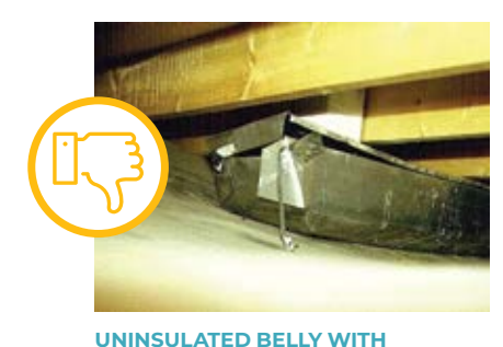
DUCT LEAKAGE