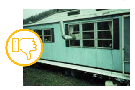
NO SKIRTING AROUND HOME